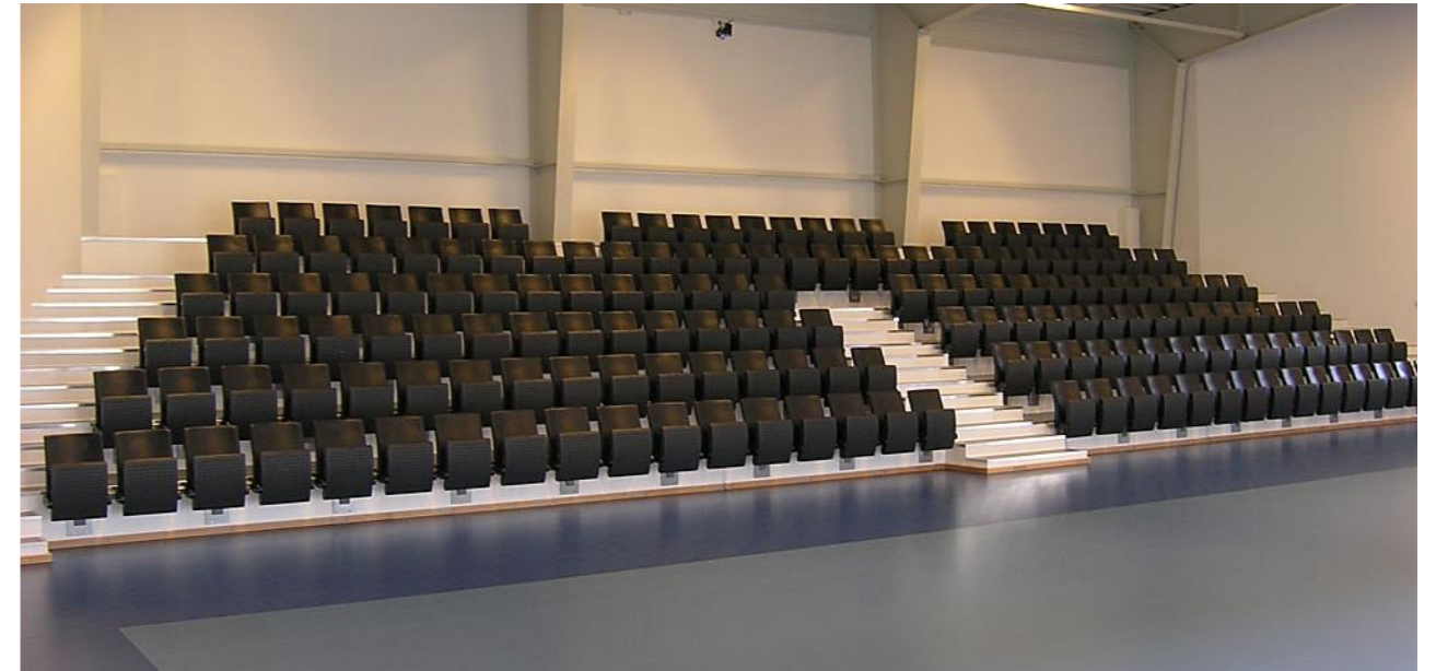
DK GUNSLEVHOLM SPORTS ACADEMY (GSA)