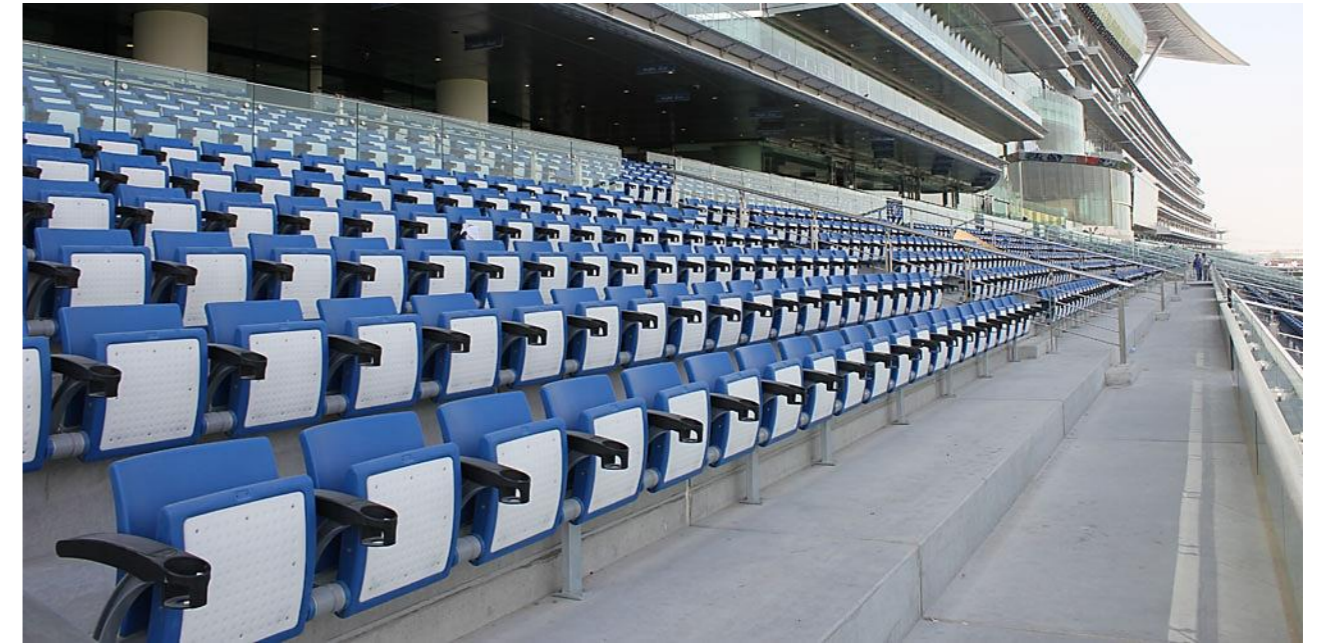
MEYDAN RACECOURSE, UAE