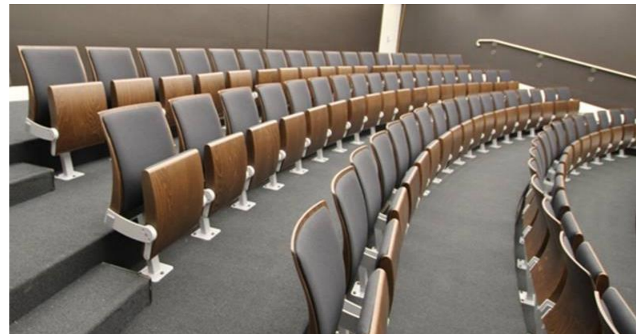
QUEENSLAND ART GALLERY, AUSTRALIA