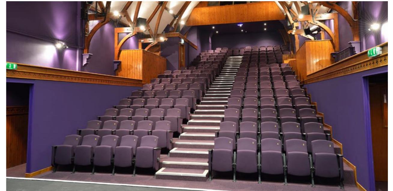
LOCHSIDE THEATRE, UK