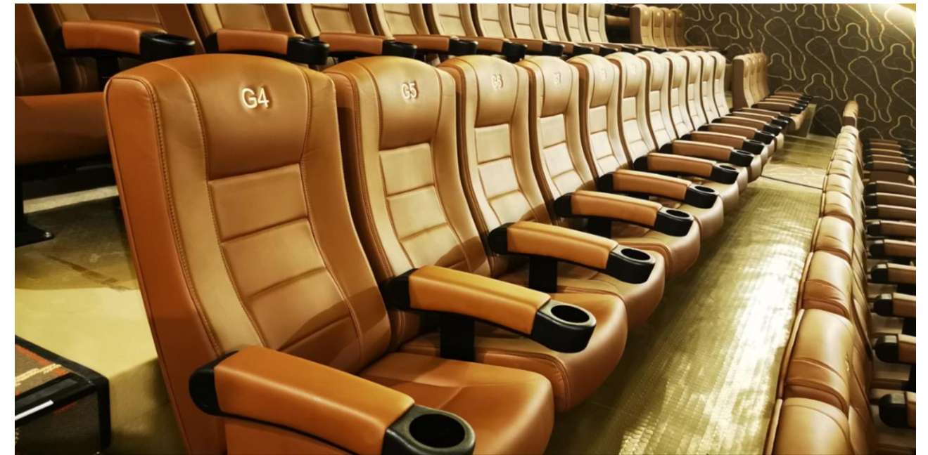
CINEPOLIS REACH GURGAON, INDIA