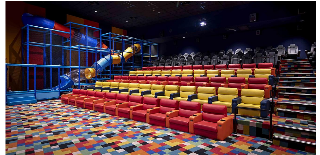
MUVI MALL OF ARABIA, KSA