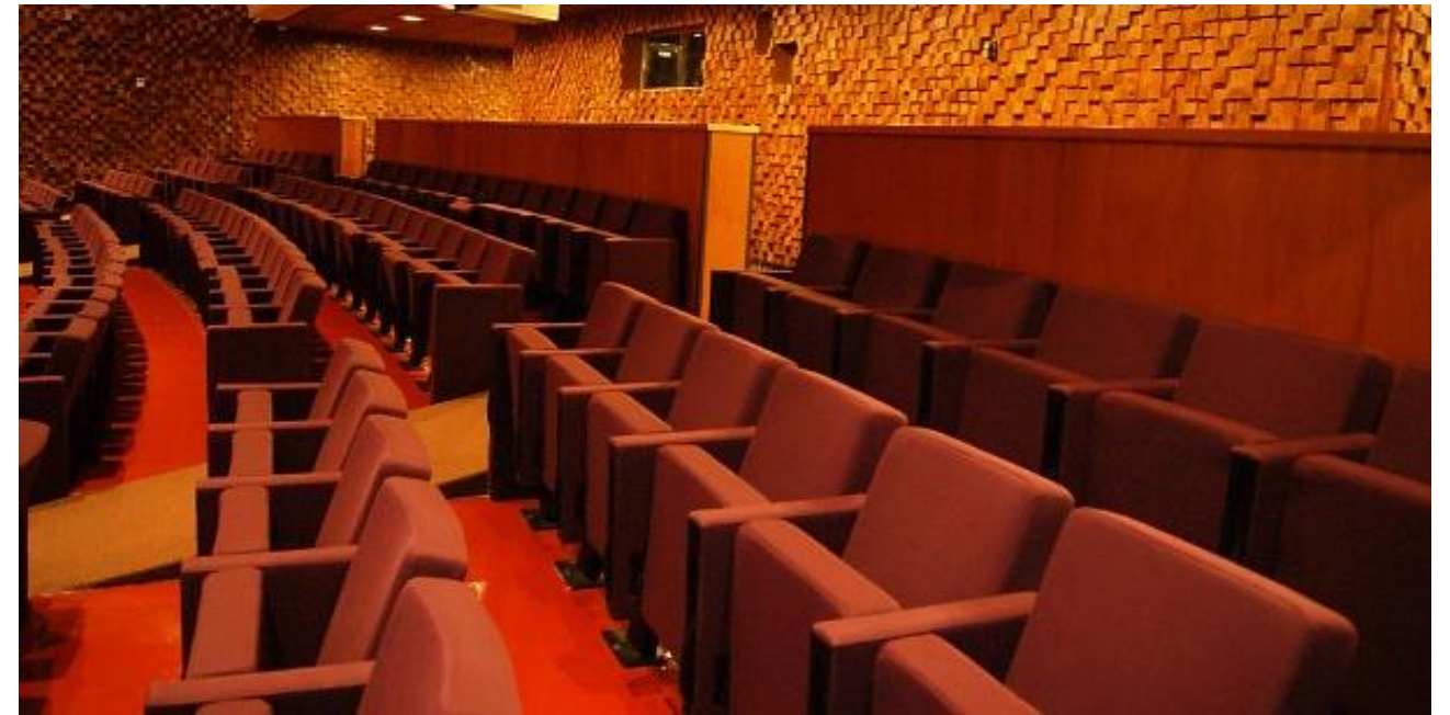
MUSEO DE ANTROPOLOGIA, MEXICO