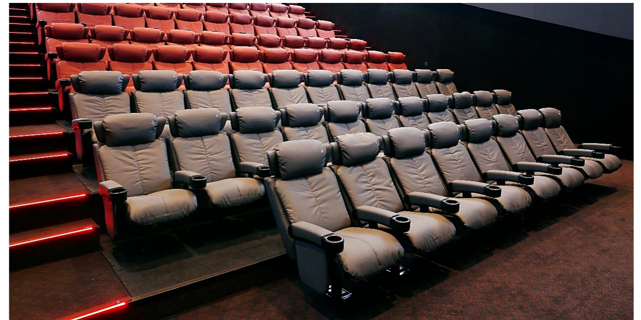
CINEMA CITY SHARJAH, UAE