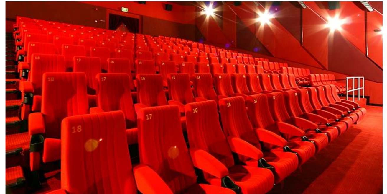
CATHAY DOWNTOWN EAST, SINGAPORE