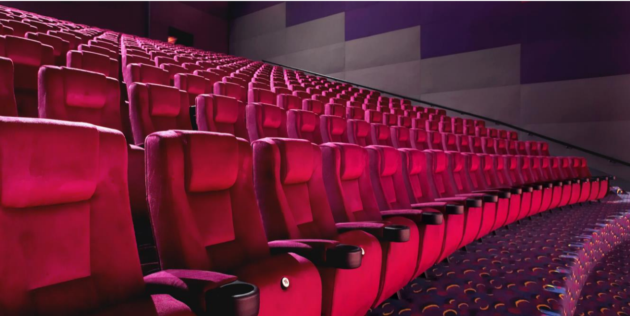
IMAX Theatre, Kuala Lumpur, Malaysia

* APPLICABLE FOR ROCKER BACK ONLY ** APPLICABLE FOR FIXED BACK ONLY