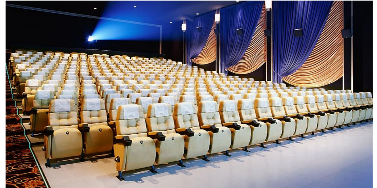
SF CINEMA EMPORIUM, THAILAND

* APPLICABLE FOR ROCKER BACK ONLY ** APPLICABLE FOR FIXED BACK ONLY