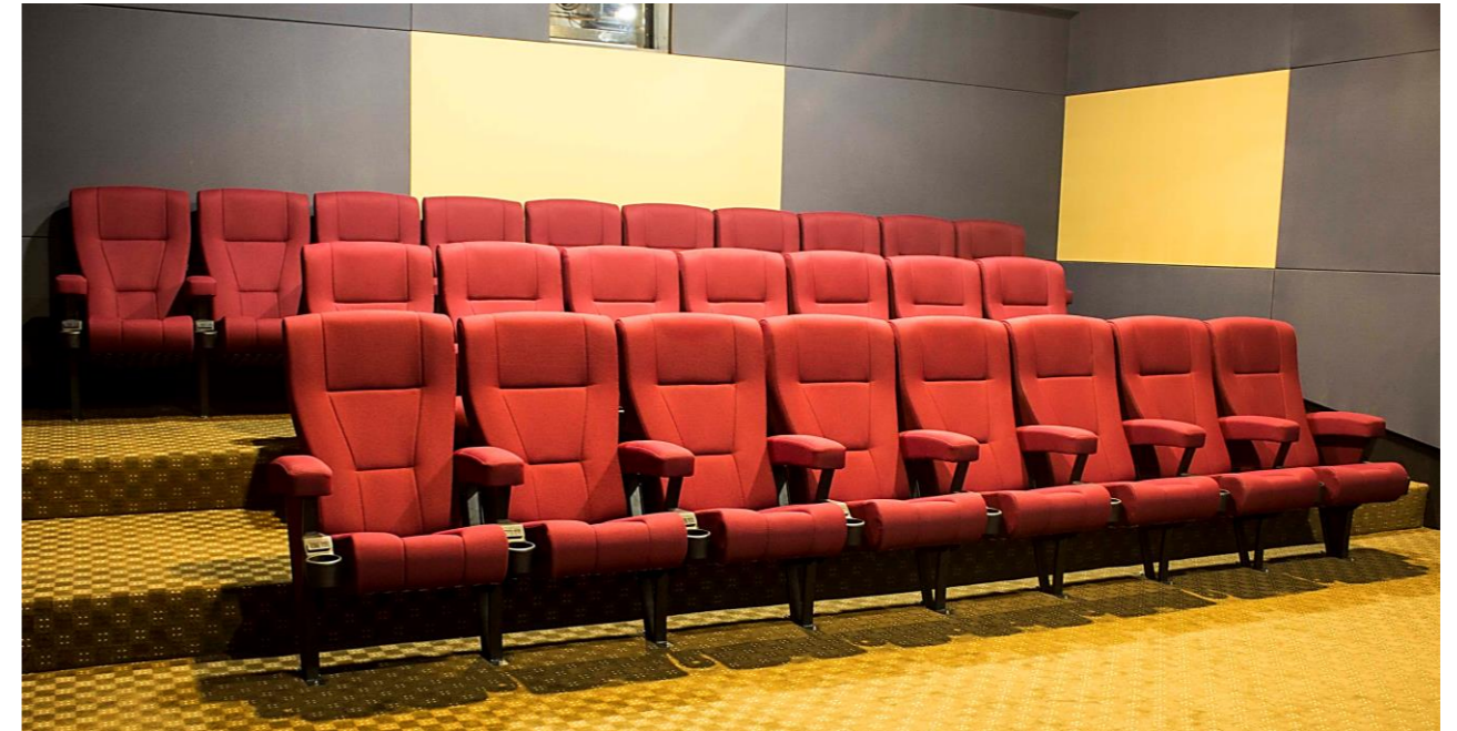
20 TH CENTURY FOX PRIVATE AUDITORIUM, MALAYSIA