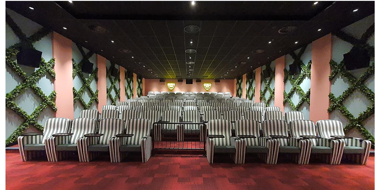
MUVI CINEMA TALA MALL, KSA