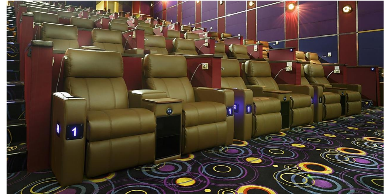
NEWPORT VIP CINEMA, PHILIPPINES