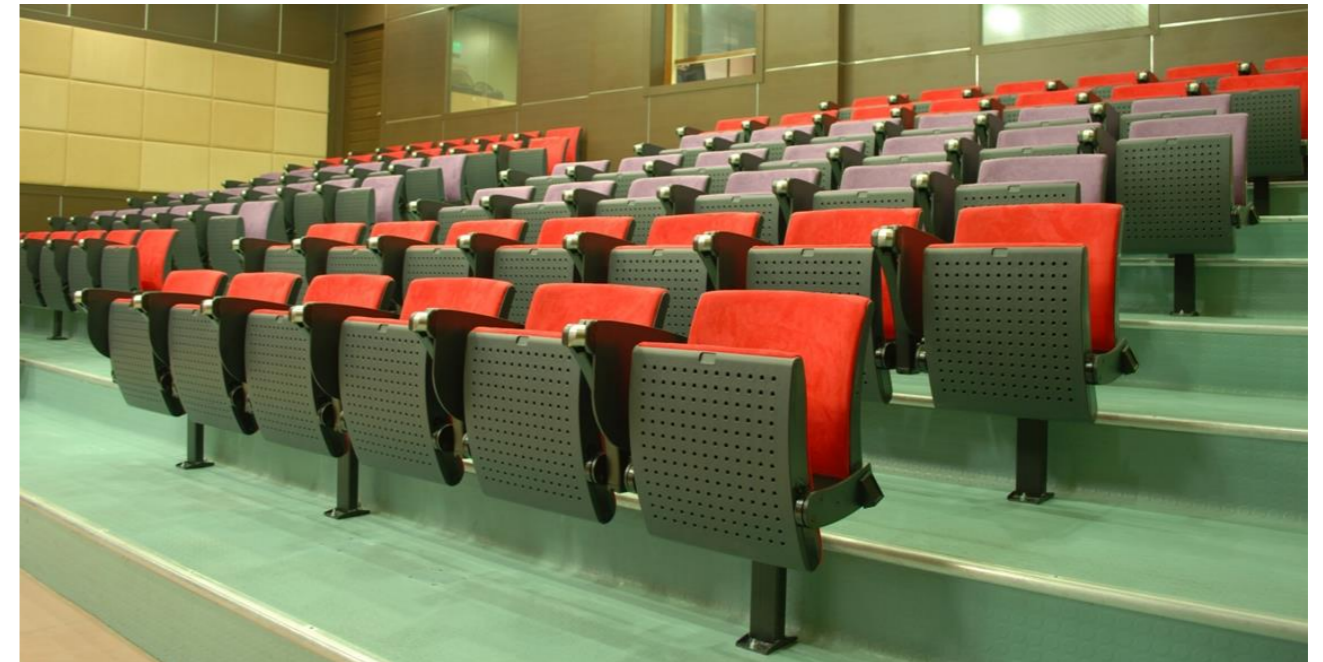
UTHM (Batu Pahat), Malaysia