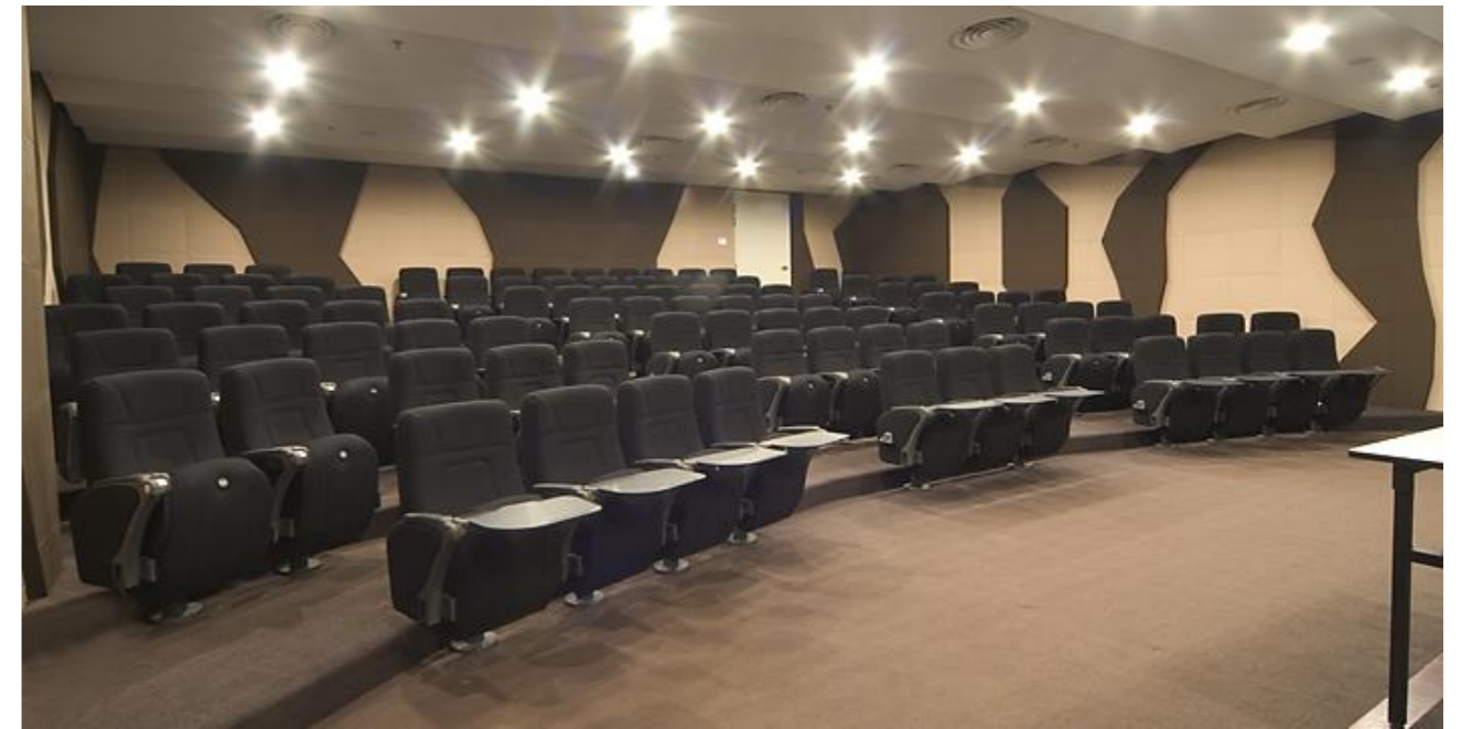
LA SALLE SCHOOL, SINGAPORE